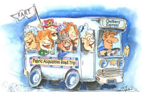
Brant Heritage Quilters Guild

The cost will be $30 each which includes a tip for the driver. There will be storage underneath and above our very comfortable seats. There is a permission slip included in the newsletter and you can sign up starting in January . The bus has 39 seats.