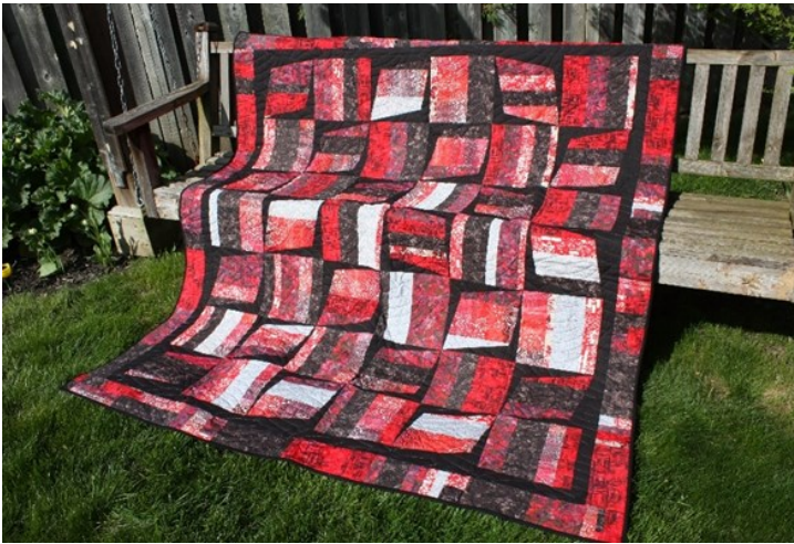
This is a lap quilt

Would you like the opportunity to acquire a brand-new quilt? At our Once Upon a Quilt 2022 event, you will be able to get a chance to own one of two opportunity quilts. Here are their photos: