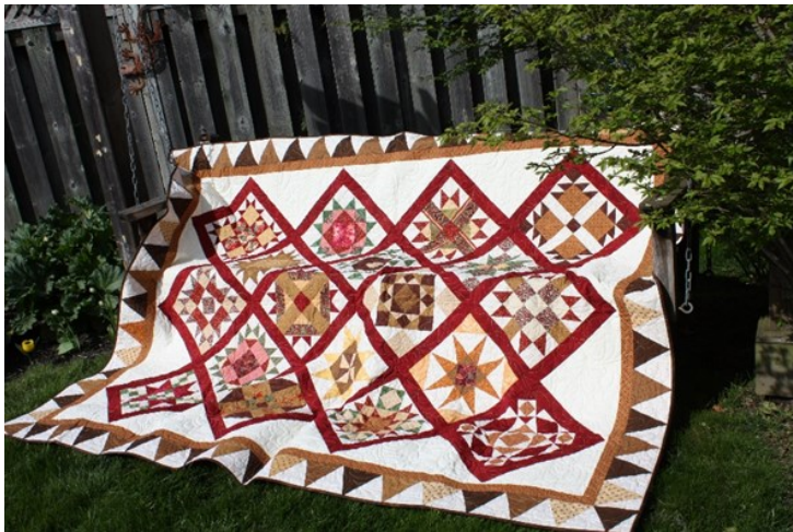
The second one is a bed size quilt.