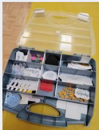
Aline uses this box to store sentiments etc.