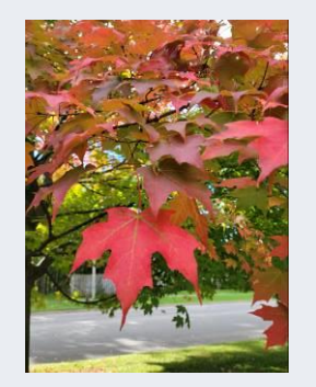
We're on the Web!

Another technique had us inking the stencil itself with different inks,