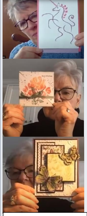
2 more versions of Elaine's Cards.

Uris used one of Liois Nixon's patterns to do this