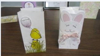
Easter theme bags, nicely Decorated.