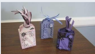
From the Show & Tell table