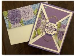
Sheila Rogers' creations