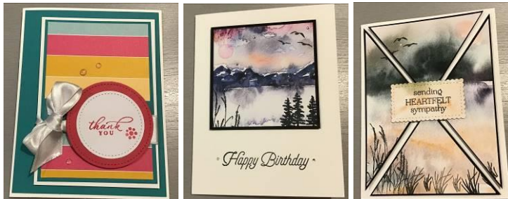
Cards by Dede