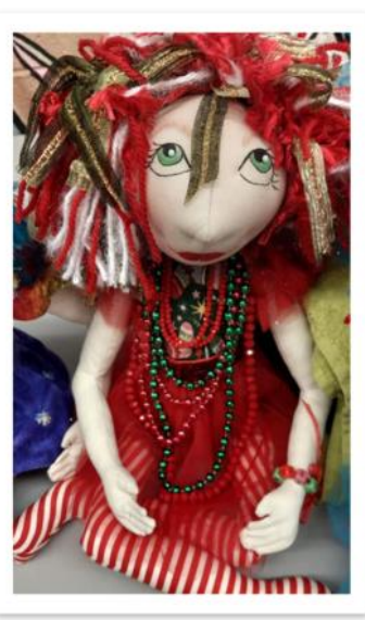
DOLLS CLASS OF 2024 REUNION JANUARY 8