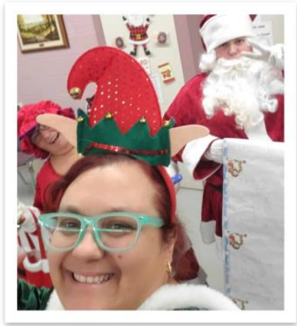
Mr. & Mrs. Claus and Elf came to visit at the December meeting.