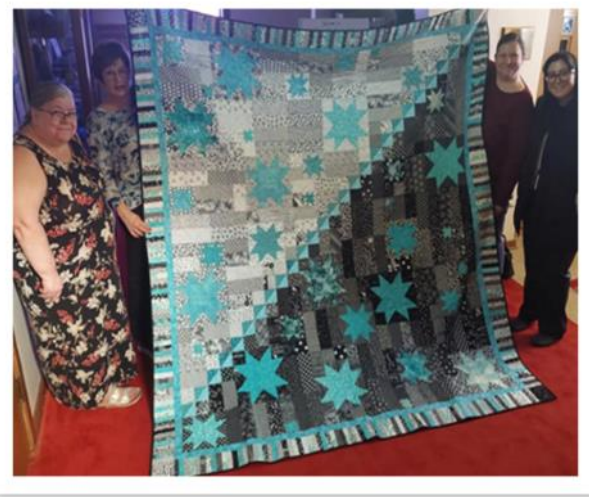
Quilt presentation to the hospital happened at November SEWday.