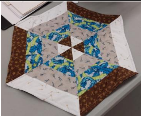
Some of the many unique placemats on parade!