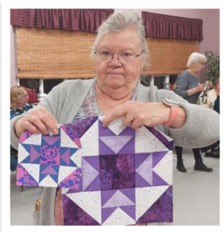
BOM 2023-2024 from A Quilting Life—only available to be purchased after December 11, 2023. https://www.aquiltinglife.com/