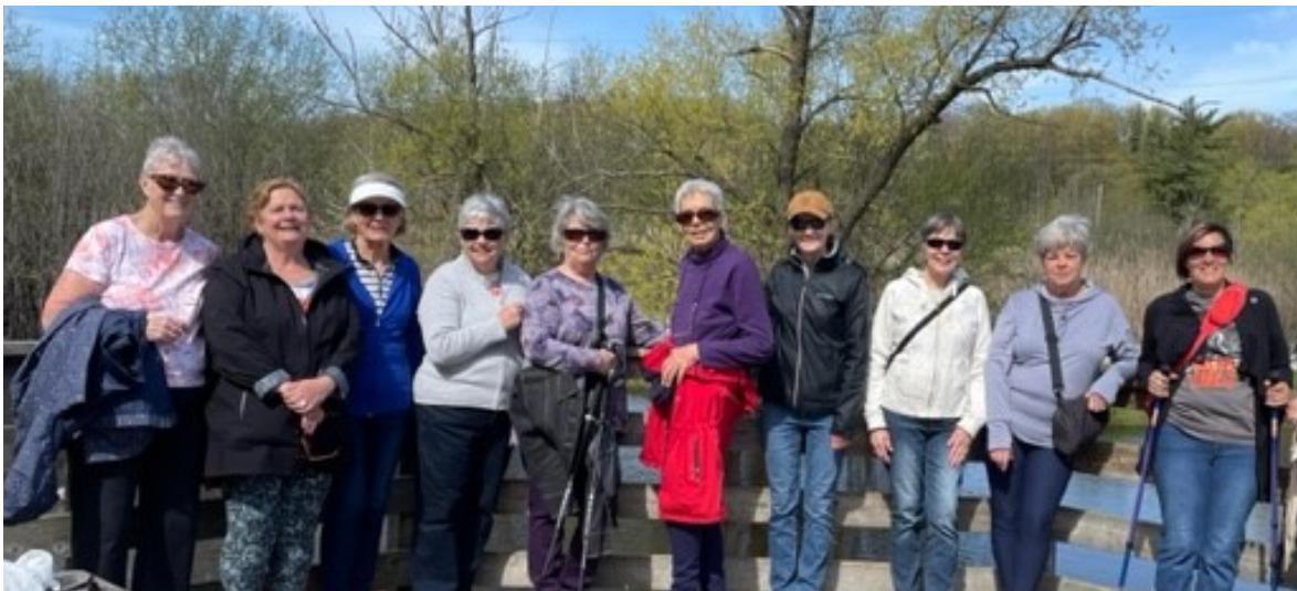
May 8 PRESTON/Riverside Probus Hike