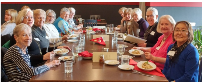
Lunch Bunch at JR Cuchina