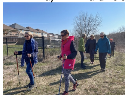
Monday April 10 Probus Hiking group Dumfries Conservation behind YMCA Hespeler Road. There was 14 of us today.