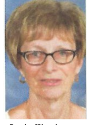
Patrice Wappler Facility