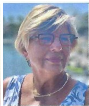
Lynda Berg Travel