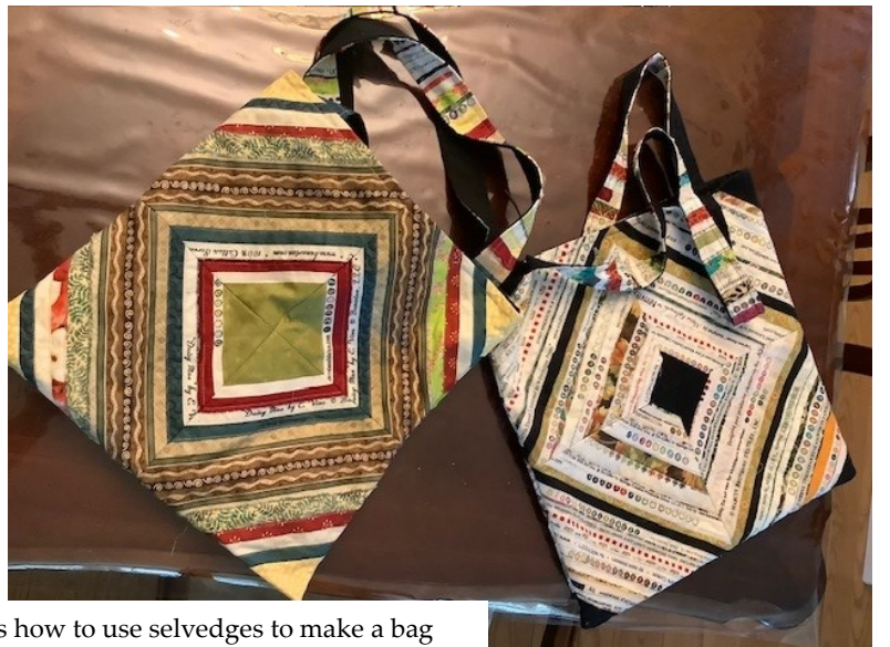
Sue teaches how to use selvages to make a bag