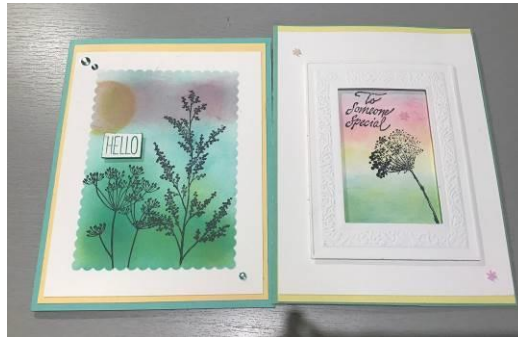
↑ Dede's Sponged Cards