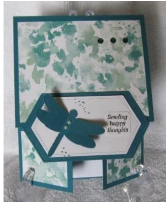
Sandra's Dutch Door

Dede's Dandy Garden designer paper cards.