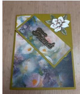
Dede's bookmark card