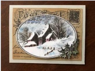
Audrey's Vintage Card