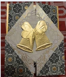
Lilo's Diamond Gate Fold Card