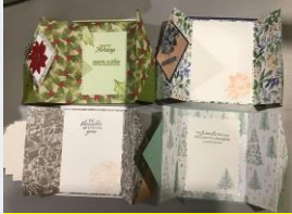
Dede's Card Insides.