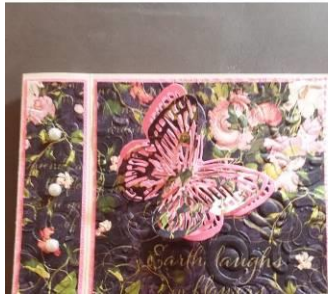
Pet's Show'n Tell Cards