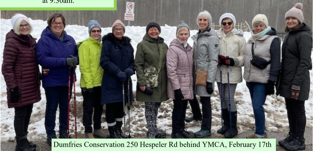
Dumfries Conservation 250 Hespeler Rd behind YMCA, February 17th