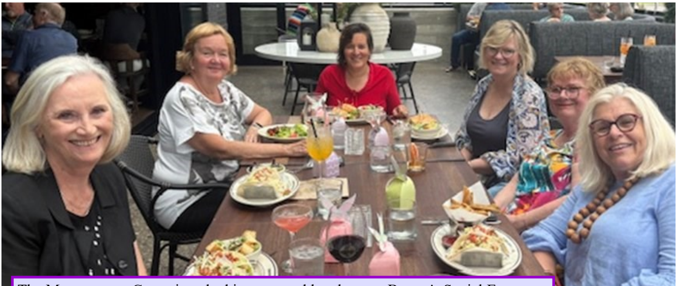
The Management Committee had its year-end luncheon at Brown's Social Eatery.