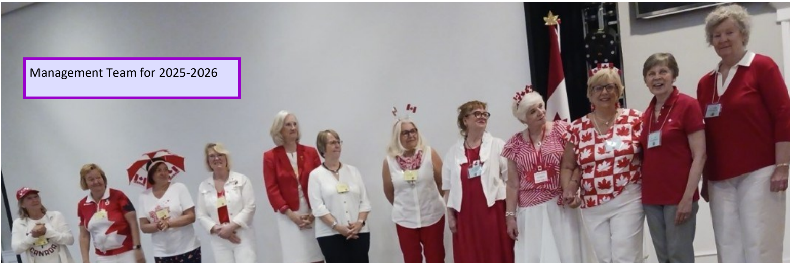
Management Team for 2025-2026

These publications have been cited over 12,800 times, according to Google Scholar.