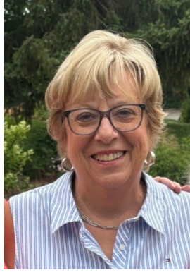
Peggy Rutherford Special Events Public Relations/Archives