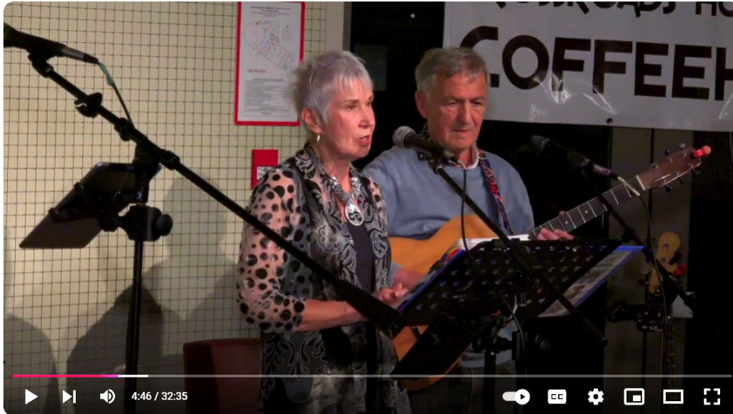
$100,000 Milestone: Crossroads Coffeehouse Celebrates 25 Years of Music and Community